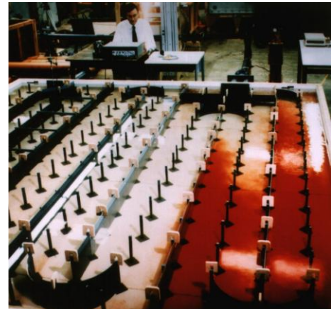
Real data produced by physical modelling

CCTs need 'Plug-Flow' hydraulics for optimum efficiency: The design of Baffles, Inlets and Outlets for CCTs determines performance.